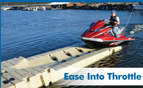
Ease Into Throttle