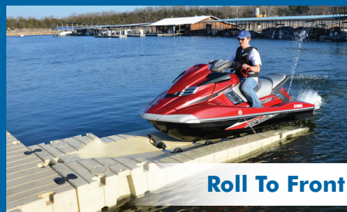
Roll To Front